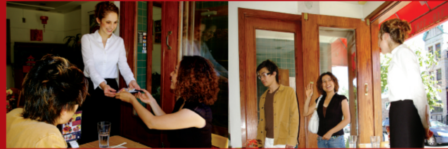
"Press it" again for checkout. Enjoy a happy day.

One of the S1 advantages is to get rid of unnecessary visits of customers from the server. Server is no longer need to ask customer's needs by himself. Customers can enjoy their dish until their next request, then it's just another press of the button.