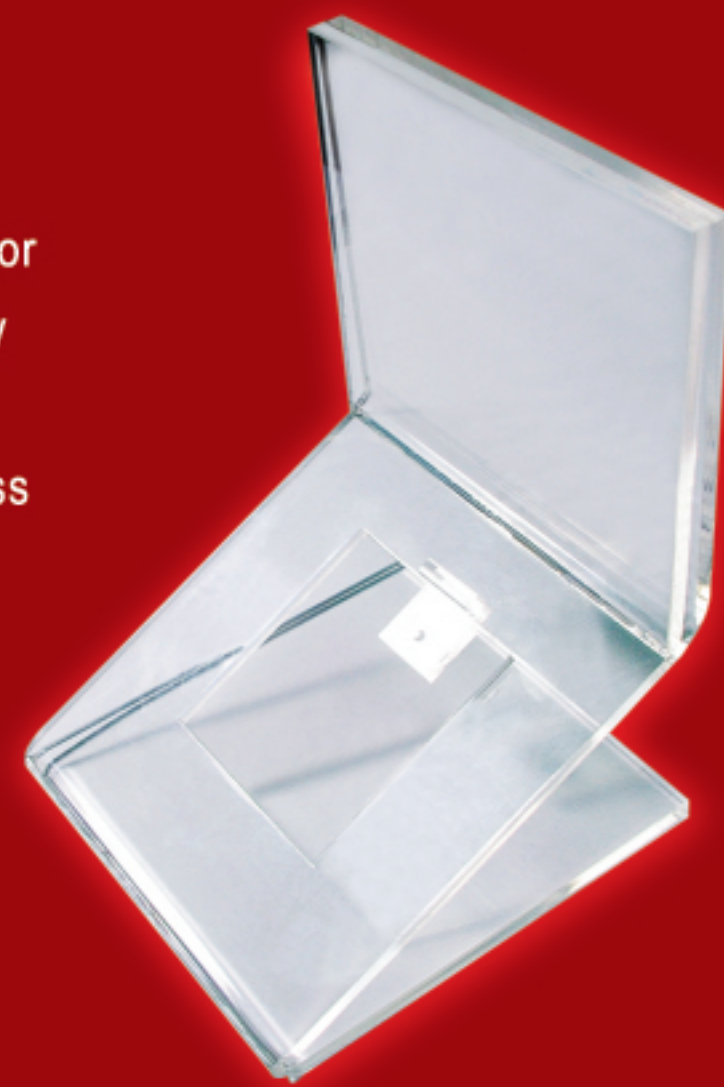
AS100 S1 Wireless Service Bell Holder