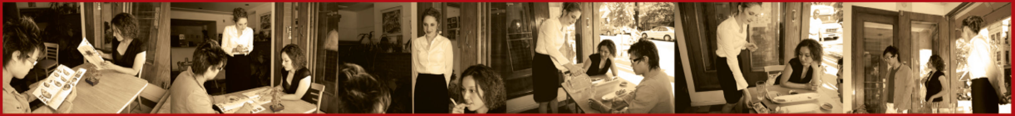
No one's around when ordering. Wait a long time for server's coming. Server's disturbing. Wait a long time for water refilling. Slow checkout process. Bad moon occurs.