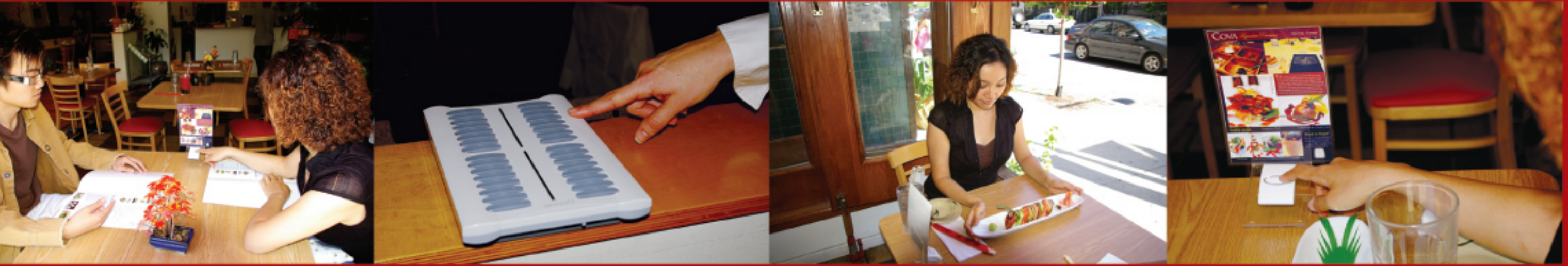
Press the Wireless Service Bell Button when ordering. As soon as the server knows your call, she'll come. Enjoying your dish without server's disturbing. "Press it" upon your needs.

We call the server upon our needs. BUT: Don't we feel whenever we are in the situations such as ready to order, getting water to refill or even checking out, there's no one for us to reach? However, if server's around, he/she's mostly watching us without servicing anything while we are enjoying our dish. Don't these frustrate you sometimes and make you a bad day?